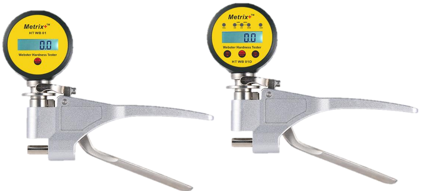
Presser/ Needle Type