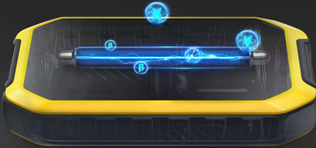
Geiger counter tube