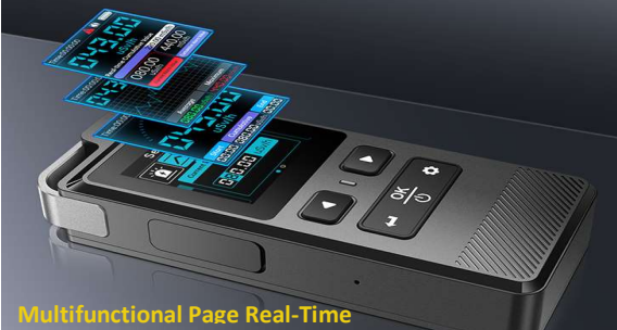
Multifunctional Page Real-Time